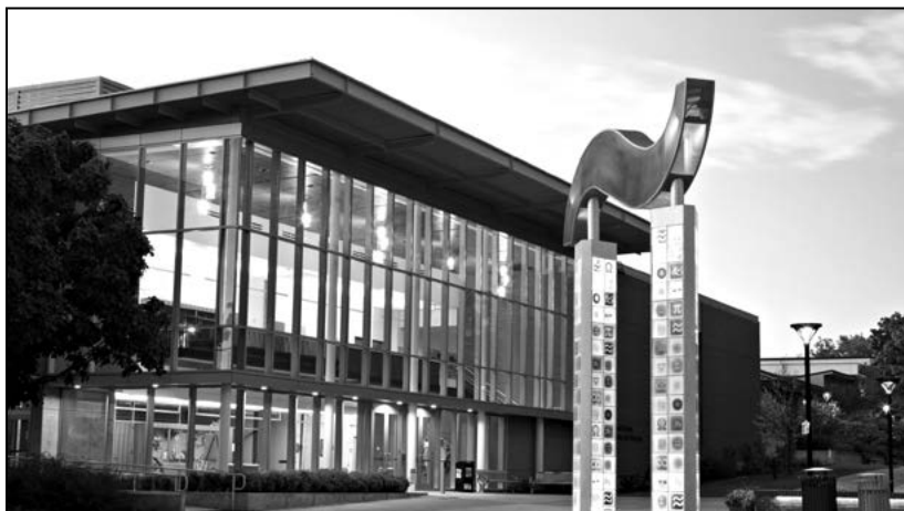
Olympic College Pi sculpture and Science and Technology Building at the Bremerton campus.

Prerequisite: Advanced standing with instructor permission.