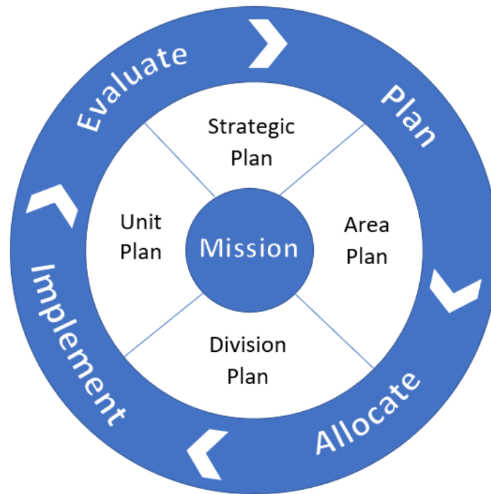
Diagram 1: Alignment of Integrated Planning with Resource Allocation