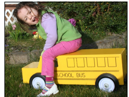
Finished school bus projects were donated to local day-care centers and enjoyed by children like Sophia.

Update: Offsetting some of the budget cuts at community colleges was an $18 million increase for Worker Retraining. That money will provide for an additional 3,700 enrollments at the state’s 34 two-year colleges. Enrollment at community colleges has increased 10 percent over the past year, a reflection of the number of people out of work.