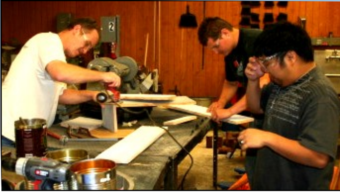
Manufacturing students work on a toy school bus project while developing communication skills needed to pull it all together.