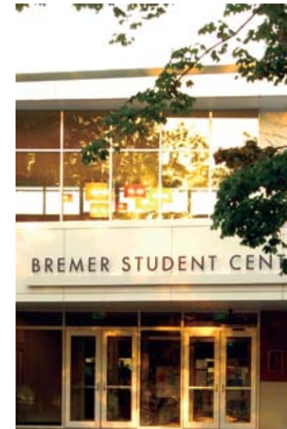
Cover photo features the Bremer Student Center located on the Olympic College Bremerton campus.

Serving Kitsap and Mason Counties with locations and educational opportunities in Bremerton, Poughkeepsie, Shelton and Naval Base Kitsap.